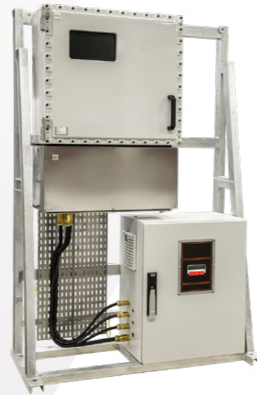
Explosion proof Digital Navais Central Control Panel

The innovative design and configuration together with the touchscreen makes the system user-friendly and intuitive for all users. Due to the modularity of the system, it can also be combined with the controls for helideck lighting and/or obstruction lighting.